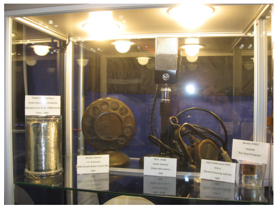
Vintage microphones at the Audio History Library booth.

Why did I go and why am I writing about it in Antique Radio Classified magazine – a publication for collectors and restorers of antique and vintage radio equipment?