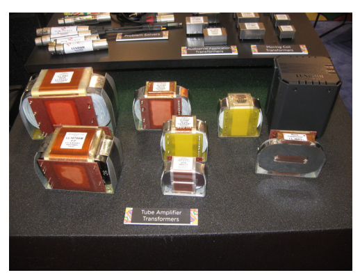
Lundahl Transformers present their tube amplifier transformers.

The AES has a Historical Committee that holds many important documents on the evolution of sound recording. But don't forget, the organization was founded in 1948 and evolved out of the phonograph industry. Many of its original members were important in the development of radio because they wanted better sound fidelity from audio equipment and better methods to record music and important events in history.