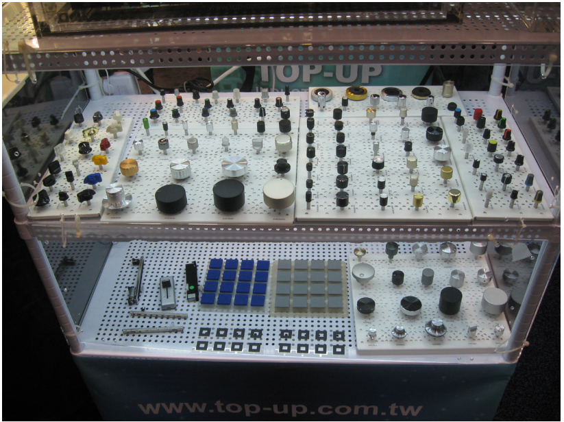
Need a knob?