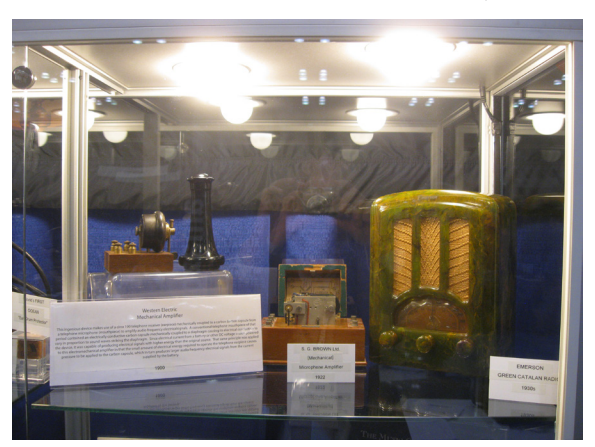
A Western Electric Mechanical Amplifier and an Emerson Catalan in the same photograph?

The AES is a professional organization of people involved in