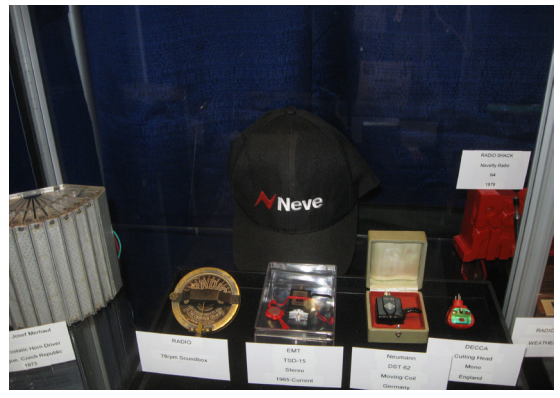
A history of phonograph cartridges.

The convention consists of an exhibition hall with companies displaying their latest professional audio equipment as well as many workshops, seminars, and presentation of technical papers.