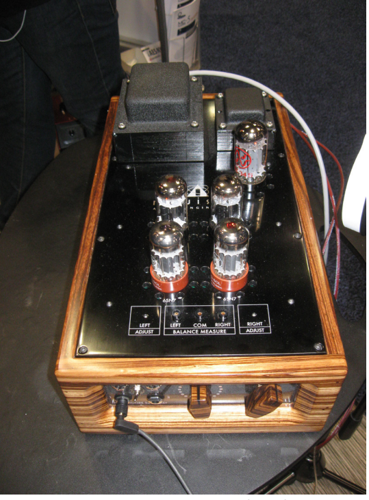
Mutec tube audio equipment.

Louis had a booth at the convention where he had many antique and vintage items on display such as microphones, a Western Electric mechanical amplifier, a green Emerson catalan radio, antique vacuum tubes, the world's first tonearm with articulating headshell, a display of phonograph cartridges from the wind up machines to present, early transistor radios, and even a RCA 45 rpm record changer.